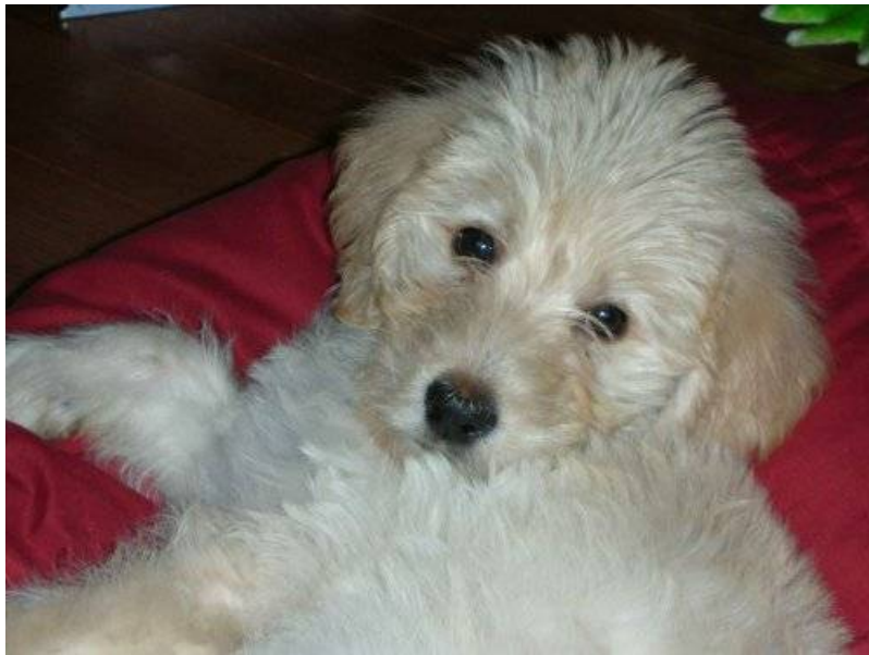
"Are you talkin' to me?" Stella

If you find a puddle or pile simply clean it up with a pet-odor neutralizing or enzymatic cleanser. If one is not available use white distilled vinegar, soap, and water. There is nothing else you can do about it. Do not use ammonia-based cleansers. Ammonia smells like urine to your dog. If you want you can hit yourself with the newspaper again but cleaning up the mess is probably punishment enough.