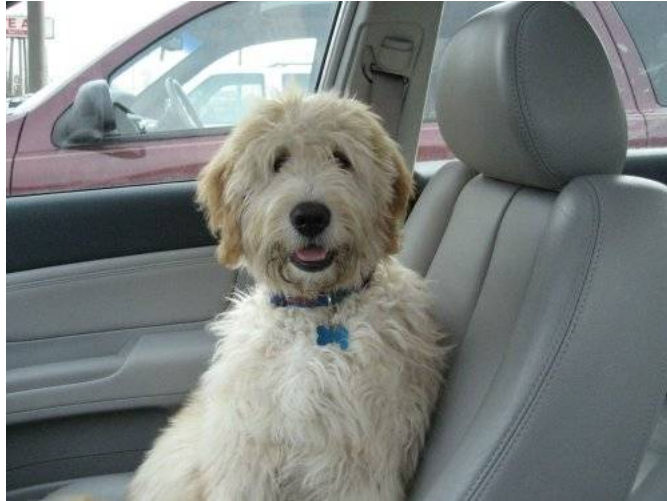
Mayzie at 5 months enjoying her car ride

your puppy is still getting carsick after six months of age, talk with your veterinarian.)