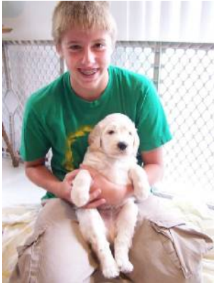
Marley at 5 weeks

As your puppy grows, you will need to purchase increasingly larger gear for them. Collars and harnesses are of particular importance. Your puppy will grow fast!