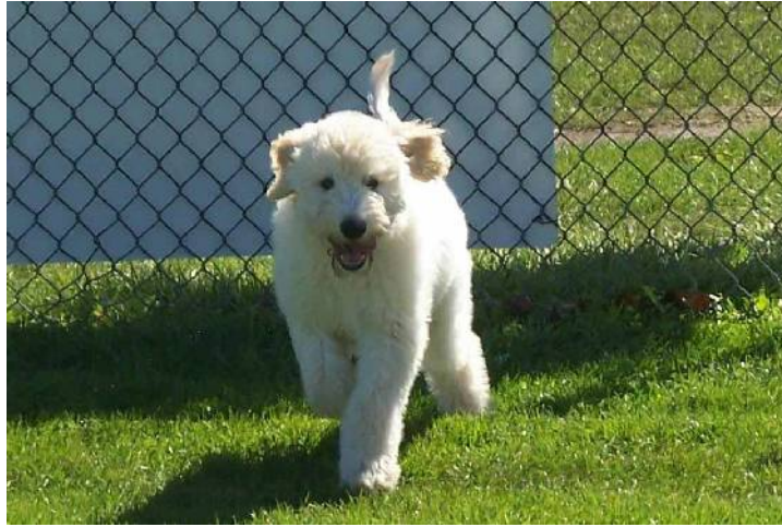
Marley at 12 weeks

least twelve months. Even then, it should be in moderation to help prevent hip dysplasia.