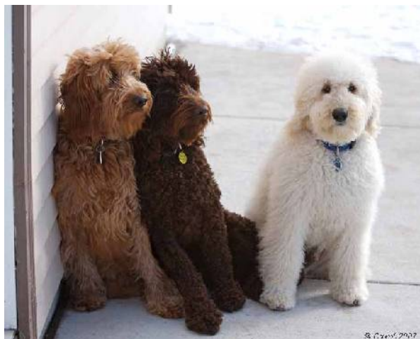
Archie, Bruno and puppy Chico

Playing 'chase' will also teach your puppy that it is OK to chase and jump on people. Good games like fetch and teaching simple tricks are fun and stimulating to your puppy. It also teaches him to obey you and your children, reinforcing good behavior.