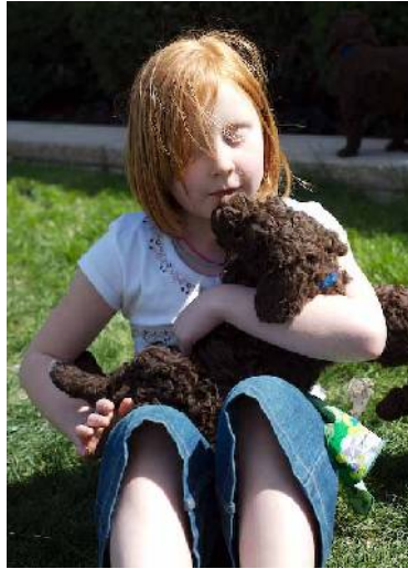
This is how your child should hold your new puppy!

A child should always be seated with an adult present. Put the puppy in the child's lap and have your child offer the puppy a chew toy.