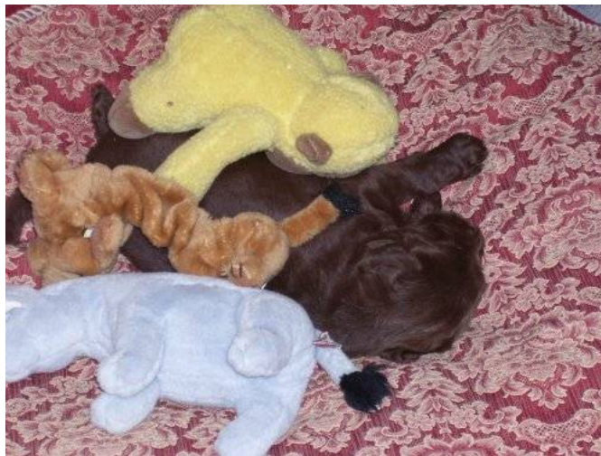
Wee Neeta Napping