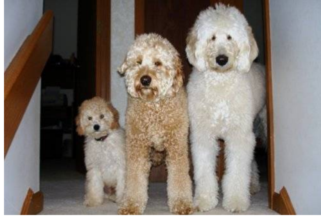
Beau, Fletcher and Spenser