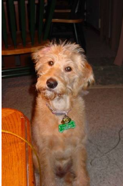
Ginger at 6 months