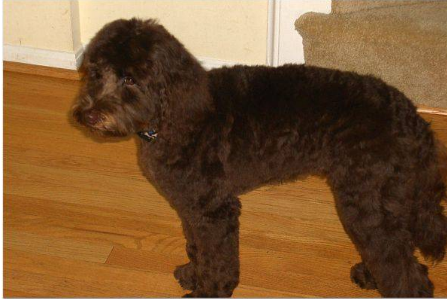
Cody Looking so handsome after a trip to the groomer.

the hair too frequently makes the coat extra fluffy and frizzy. It will eventually settle back into place, but it could take several days. Therefore, it is better to brush thoroughly once every few weeks to a month. Expect a good thorough brush through to last about an hour.