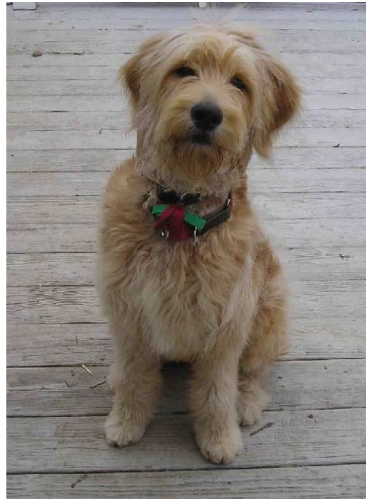
Finnegan at 7 months