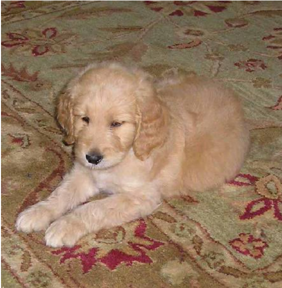
Finnegan at 3 months