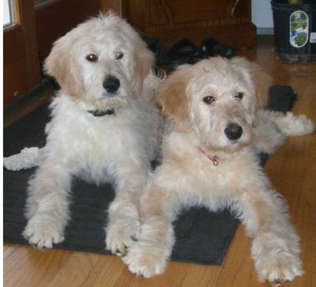
Linus and Lucy at 10 weeks

One great way to inhibit the biting reflex is to allow the puppy to play and socialize with other puppies and socialized older dogs. Puppies love to tumble, roll and play with each other, and when puppies play they bite each other constantly. This is the best way for puppies to learn to control themselves when they bite. If one puppy becomes too rough when playing, the rest of the group will punish him for that inappropriate behavior. Through this type of socialization, the puppy will learn to control his biting reflex.